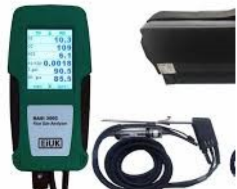
Flue gas analyzer