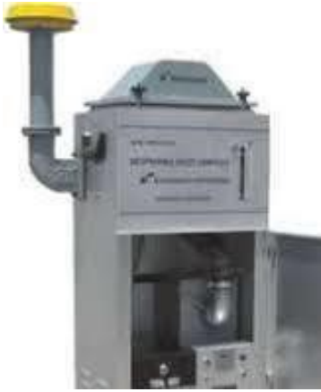
High Volume Air Sampler