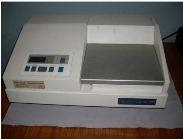
UV visible spectrophotometer